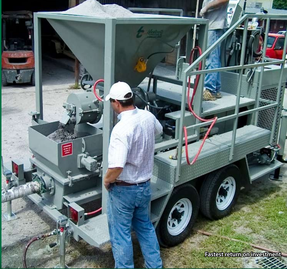
Fastest return on investment