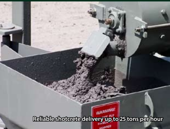
Reliable shotcrete delivery up to 25 tons per hour