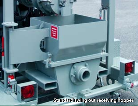
Standard swing out receiving hopper