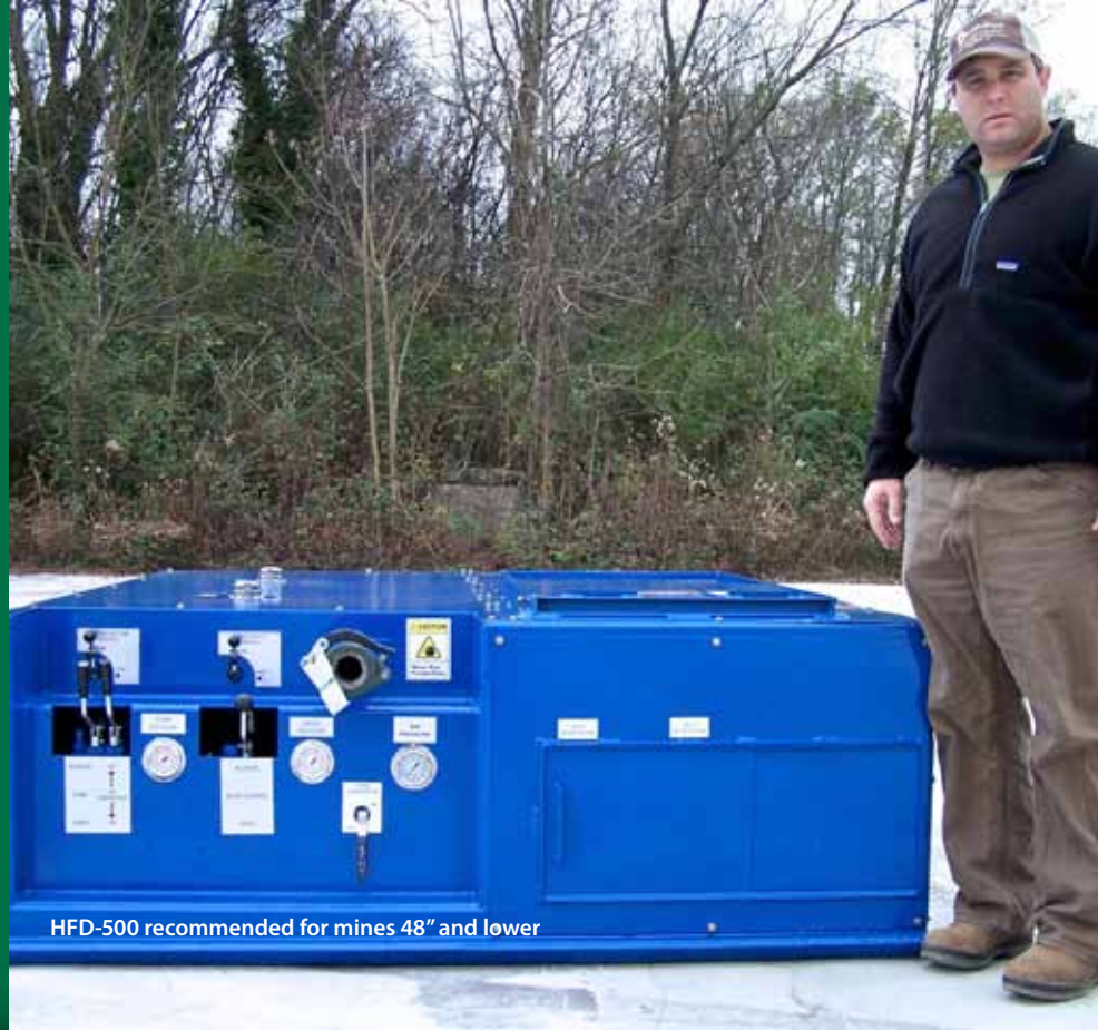
HFD-500 recommended for mines 48" and lower