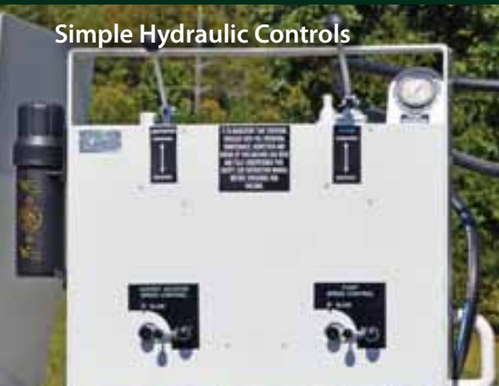
Simple Hydraulic Controls