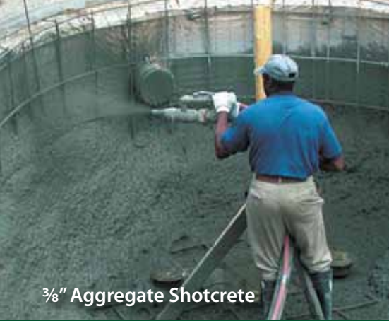
3/8" Aggregate Shotcrete